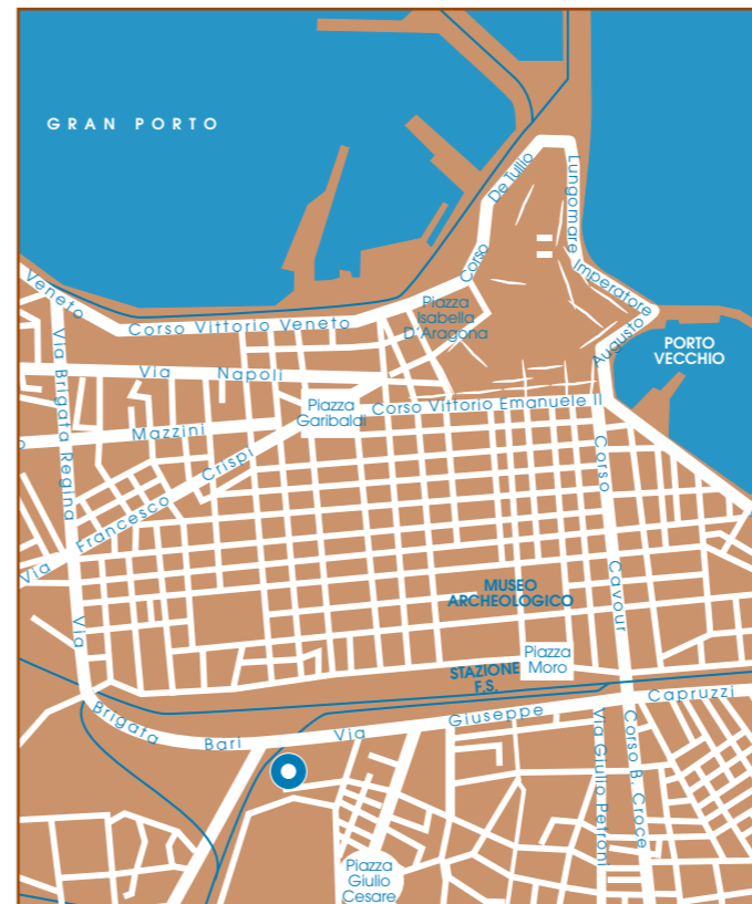
● Villa Romanazzi Carducci